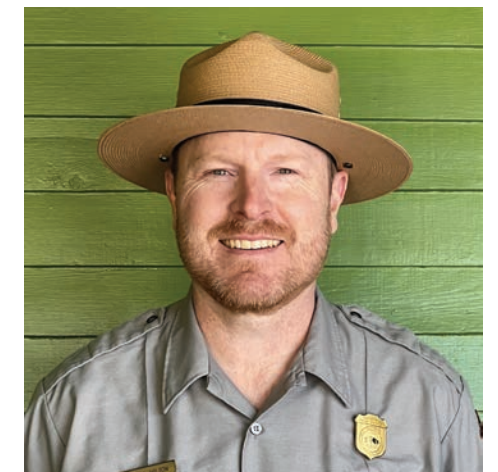
Ulysses S. Grant National Historic Site