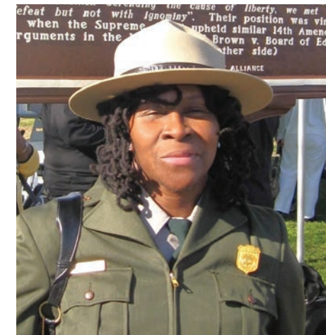
Robin White Little Rock Central High School National Historic Site