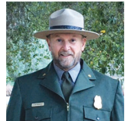
Curt Dimmick Missouri National Recreational River